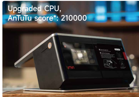
Upgraded CPU, AnTuTu score*: 210000