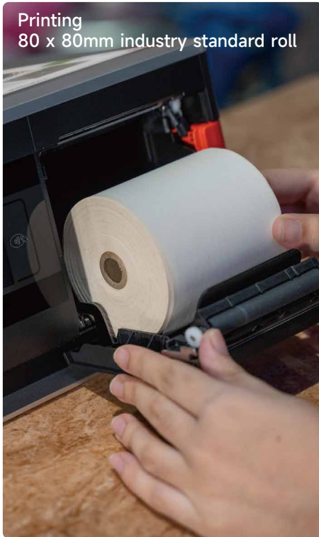
Printing 80 x 80mm industry standard roll