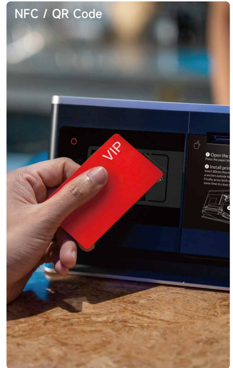
NFC / QR Code